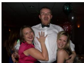
Hard at work...

(Note - not all of these are real excuses) (Extra note - Swamp Pig did try to eat my computer but choked on my dongle)